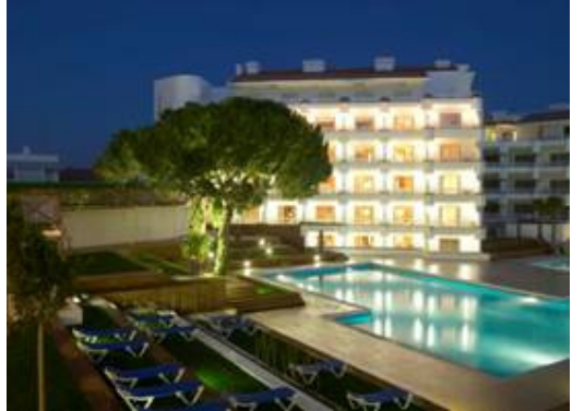
[Aqualuz Lagos Suite Hotel Apartamentos]

The third quarter's milestone was the launch of operations at the Troiaresort, comprising: the inauguration of Aqualuz Tróia Mar , a four star suite apartment hotel with 76 apartments, Wellness Centre & SPA centre and food and beverage area, managed under the brand Aqualuz Suite Hotel Apartamentos ; the beginning of operations of Tróia Marina, and; the opening of Troiamarket.