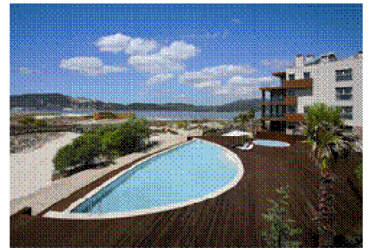
[Beach Apartments - Troiaresort]