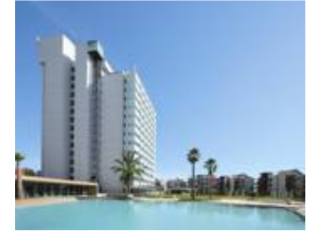
[Aqualuz Tróia Mar Suite Hotel Apartamentos]

The remaining Aqualuz hotel units in Tróia, Aqualuz Troia Rio and Aqualuz Troia Lagoa , are due to open until the end of 2008, contributing to the appeal of Troiaresort as a new tourism destination in Portugal.