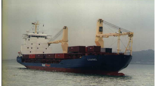
At the end of the third guarter, both turnover and operational cash-flow (EBITDA) remained above those in the similar period in 2007.

The cabotage market continued experiencing a downward trend in line with business activity general. However, the company is in endeavouring to reach the proposed figures at the end of the current year.